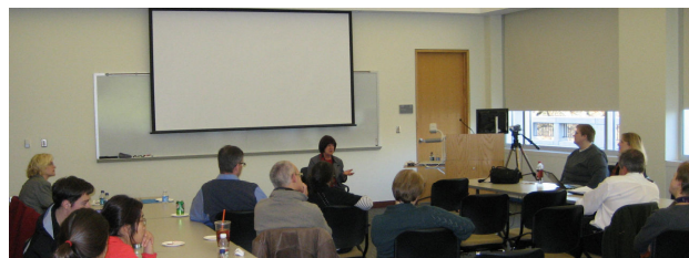
Six Frames of Informed Learning Workshop