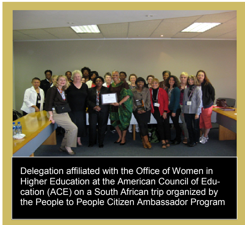
Delegation affiliated with the Office of Women in Higher Education at the American Council of Education (ACE) on a South African trip organized by the People to People Citizen Ambassador Program

An interesting development in improving higher education is the national government mandate for each academic institution to establish a research directorate and how this has impacted libraries. Before apartheid was abolished in 1996, research was not an established process at the post-secondary education institutions called “technikons” which had been established as vocational education centers primarily for black African students. Since, they have evolved to offer graduate degrees up through the doctorate with university status and all faculty and graduate students are expected to do original research. Because the South African government performs annual audits of research and publishing and cash is awarded based on publishing outputs, most libraries have implemented digital repositories to capture the cumulative annual scholarship produced.